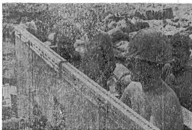
PROTECTION — The men of Battery D, 71st Artillery run crew drills while attached to the 2nd Battalion, 77th Artillery at Prek Klok. The big quad-fifty caliber machine guns provide protection for the battalion's big guns.