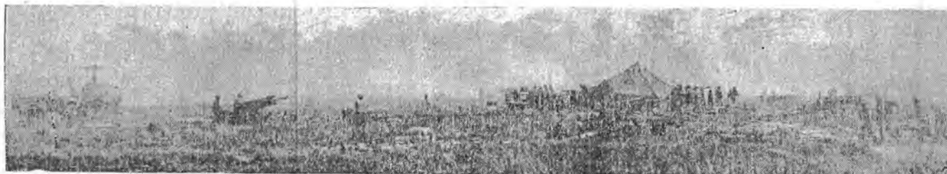
BATTLEFIELD — The howitzers of the 2nd Battalion, 77th Artillery continue to pound the enemy during the Battle of Suoi Tre while a dustoff waits for an injured man.